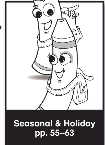
Seasonal & Holiday pp. 55–63