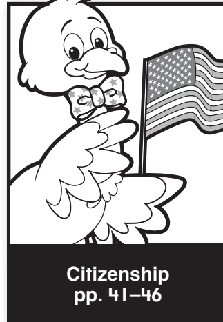
Citizenship pp. 41–46