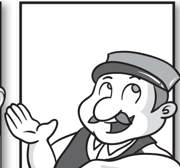
Sentences pp. 23–34