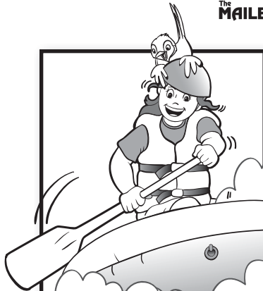
Multiple-Meaning Words pp. 3–12