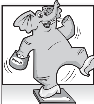
Number Sense and Place Value pp. 13–22